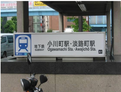
Ogawamachi, Awajicho A1