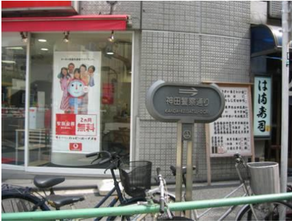
Kanda Keisatsy Dori