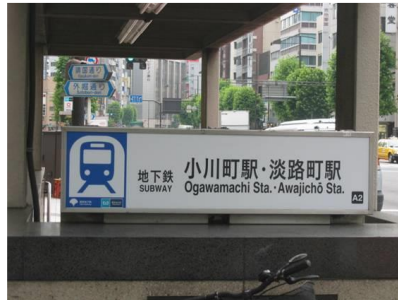
Ogawamachi, Awajicho A2